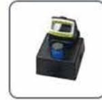
Bluetooth Charging Cradle