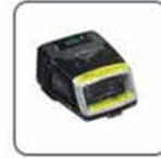
IP65 Water-proof Dust-proof