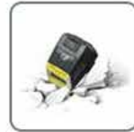
1.5M Drop Test