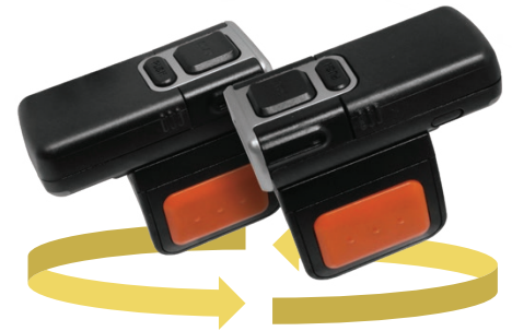
AMBIDEXTROUS RING TRIGGER

For the further inquiry, please contact: service@pointmobile.com