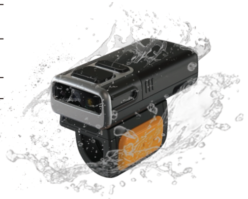
IP65 WATER/DUST RESISTANCE